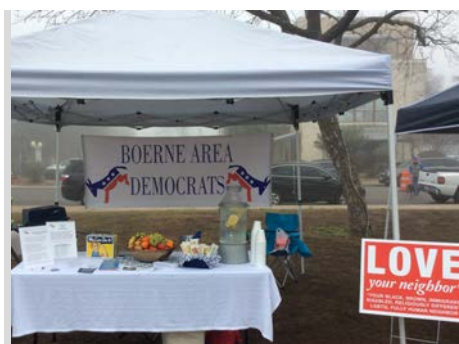
B.A.D. Booth at Heal the Soul Walk/Run for the Kendall County Women's Shelter